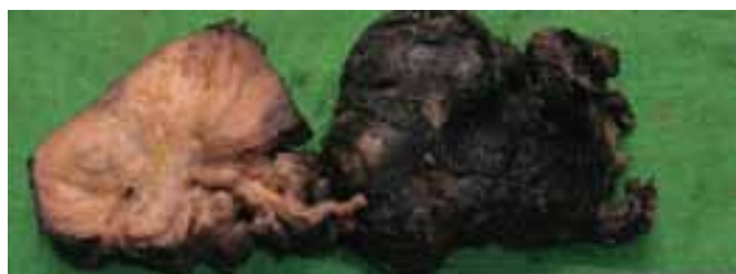
Fig. 1 : Specimen of Left Adrenal Gland showing Pheochromocytoma

Laboratory investigation were as follows; Hemoglobin was 8.8 g/dl (MCV 54.4fl, MCH 18.9 pg, MCHC 34.6%), WBC count 7700/c.mm (neutrophil - 77%, lymphocytes - 22%, monocytes - 1%), platelet count 2.79,000/c.mm, blood glucose 90 mg/dl, serum calcium was 7.8 mg/dl, serum creatinine was 0.9mg/dl, serum phosphorus was 4.5 mg/dl, serum sodium 137 mEq/L, serum potassium 4.6 mEq/L, serum uric acid was 5 mg/dl, urine routine was normal. The electrocardiography showed left ventricular hypertrophy with strain. Chest X Ray was normal. 2D Echocardiography showed hypertensive heart disease with